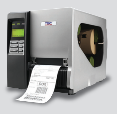
Value · Performance · Support