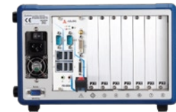
PXIS-2558T Back View