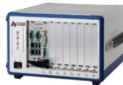
PXIS-2508 Front View