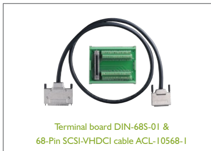
Terminal board DIN-68S-01 & 68-Pin SCSI-VHDCI cable ACL-10568-I