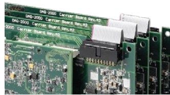
SSI bus cable for multiple card synchronization for DAQ/DAQe-2000 series