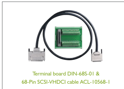
Terminal board DIN-68S-01 & 68-Pin SCSI-VHDCI cable ACL-10568-1

* For more information on mating cables, please refer to P2-59/60.