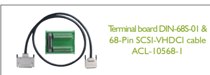
Terminal board DIN-68S-01 & 68-Pin SCSI-VHDCI cable ACL-10568-I