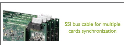
SSI bus cable for multiple cards synchronization

16-Bit Multi-Function DAQ Card with 2-CH Encoder Input